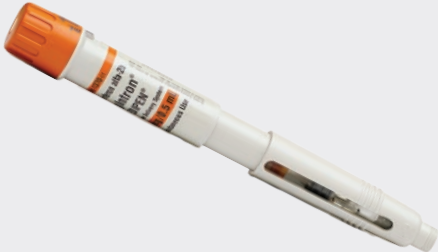
PegIntron (peginterferon alfa-2b)