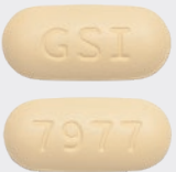
Sovaldi (sofosbuvir (GS-7977))